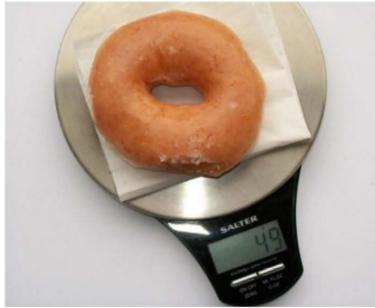
yeast donut, glazed, 49 grams

How many MILLIGRAMS of sugar are in each kind of donut?