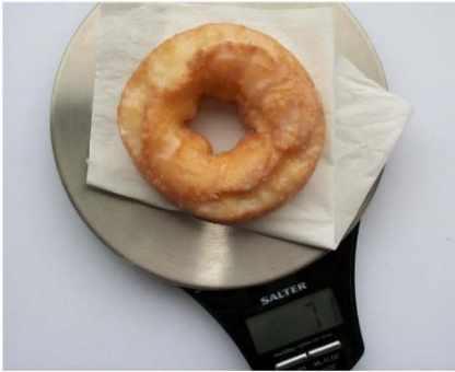
cake donut, glazed, 71 grams